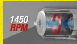
Low Motor Rotation Speed