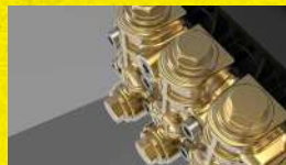
Long-Life Brass Head

With maximum reliability and the best technology & components used, we can assure that Lavor machines work continuously and at top performance .